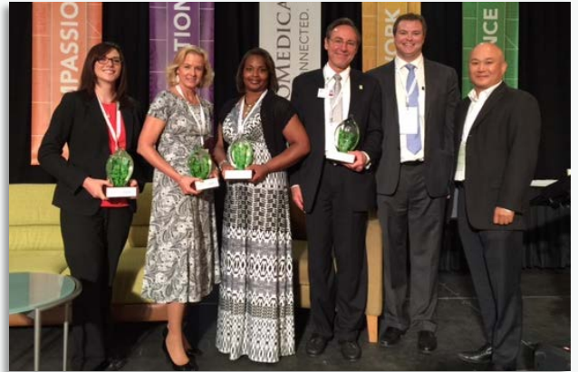
ProMedica Laboratories received the ProMedica Innovations Inventor of the Year Award 2015, which recognizes its leadership to bring their innovation to the market efficiently.

The success of LACS™ is a testament to the power of disparate technologies working together to improve people’s lives. Kaonsoft has barely scratched the surface of the potential impact of combining innovative solutions together to bring about total digital transformation. Xamarin tools enable Kaonsoft to rapidly build business specific applications on its agile KEMP platform for any mobile device (iOS, Android and Windows). Hosting the app on the Microsoft cloud provides a centralized database and added security. Leveraging the various of Azure backend services then help to drive further improvements in real-time. Such powerful combination can yield big changes both within and outside of the healthcare industry. The possibilities are endless.